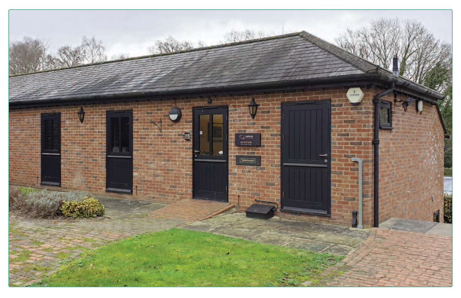
UNIT 5 ● BIRTLEY COURTYARD ● BRAMLEY GUILDFORD ● SURREY GU5 0LA